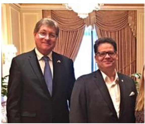
Project meeting with the Panamanian Ambassador