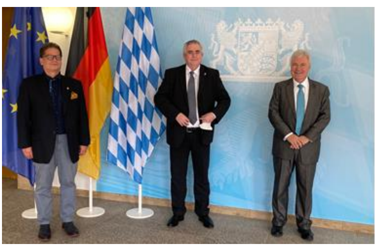
Meeting with Bavarian Ministry of Economic Affairs