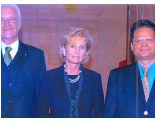
Conversation with the Prime Minister of Bavaria, Horst Seehofer