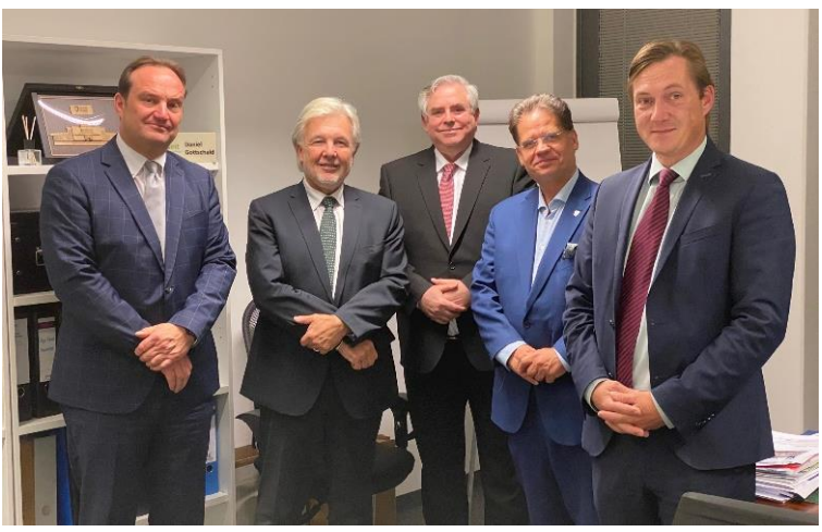
Meeting with TUM International and BIIG Wheel