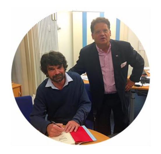
Interview with the managing editor of "Donaukurier."