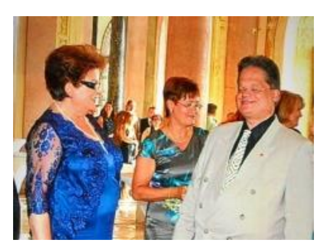
Conversation with the former Prime Minister of Bavaria, Edmund Stoiber