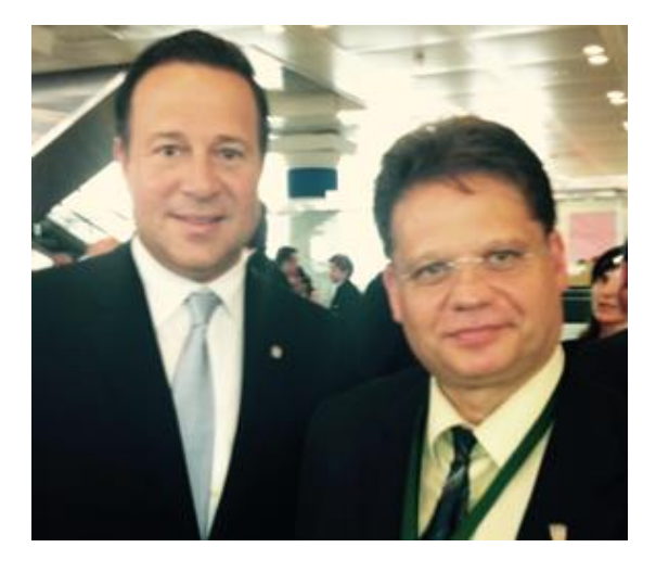
Meeting with the President of Panama