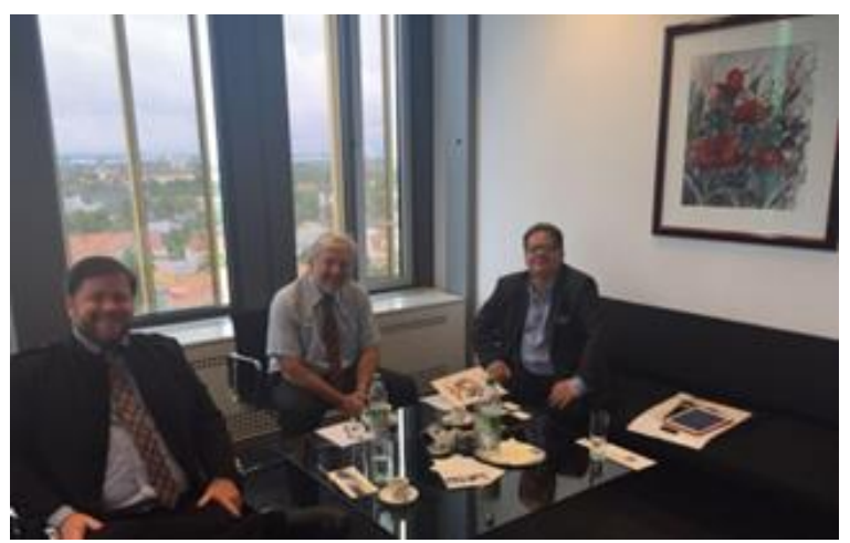
Meeting with the General Manager from "Bayern International