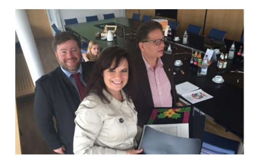
Project meeting with the Chamber of Crafts in Munich with the Director for International Economics