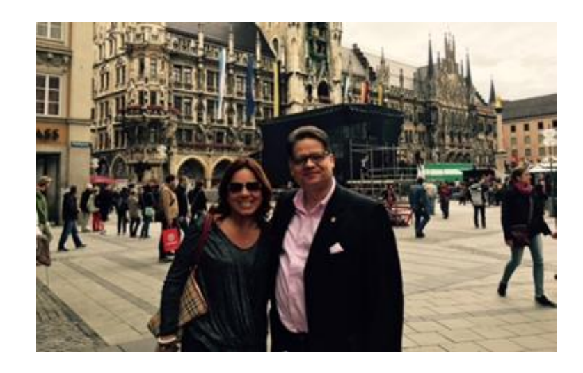
Meeting with the Vice Minister of Tourism / ADP