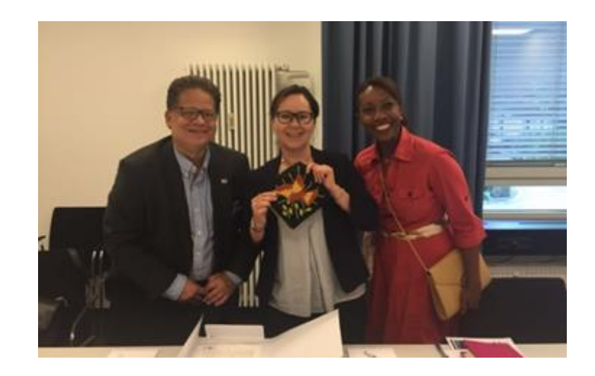
Meeting with the Management of IHK Munic - Bavaria